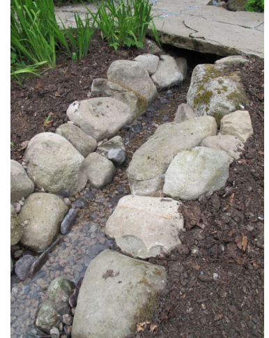
Rocks in the Rill from the Dripping Well

job. Work on the Rock Garden has been continuing with the restoration of the rill between the Dripping Well and the upper pond which was leaking; the artistic skills of Elizabeth and grand-daughter Lucy have been fully employed on setting out the rocks. The collection of Epimediums built up over the last ten years in the Rock Garden is worth a close look: in my view E. grandiflorum which we collected in Japan in 1980 is one of the best, it grows by the Dripping Well.