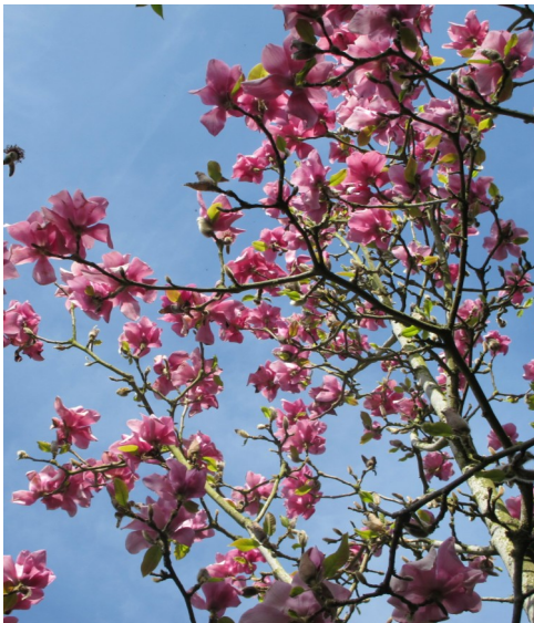
Above Magnolia 'Vulcan'